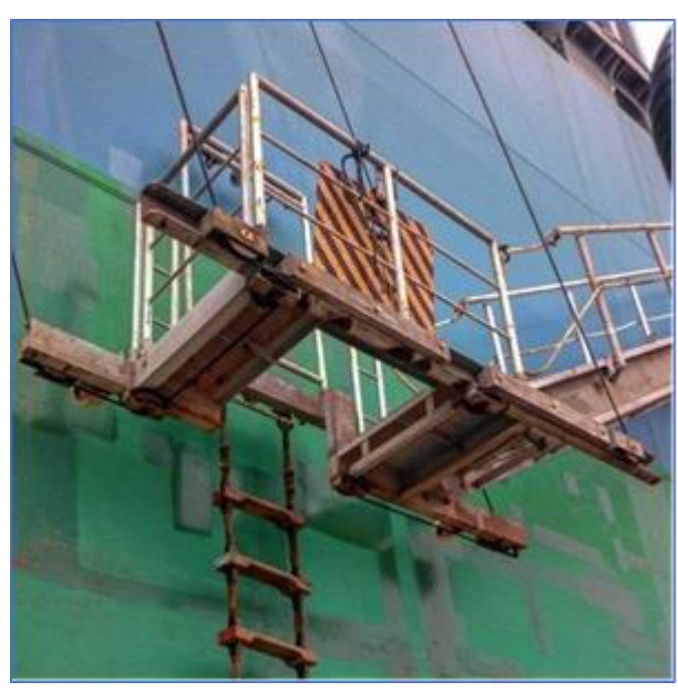
Fig 1: Non-compliant Arrangement

The relevant documents are SOLAS V Regulation 23, IMO Resolution A. 1045 (27) and guidance from Embarkation & Disembarkation of Pilots Code of Safe Practice.