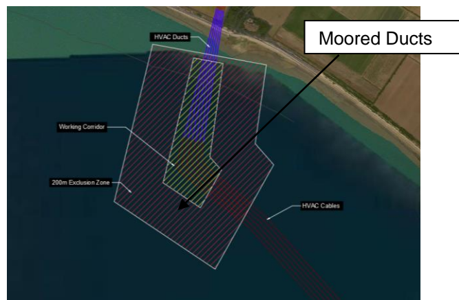
Fig 1 – IFA2 Interconnector Project – Chilling Exclusion Zone

The ducts will be moored in the positions provided at Fig 2 which are at the seaward end of the exclusion zone.