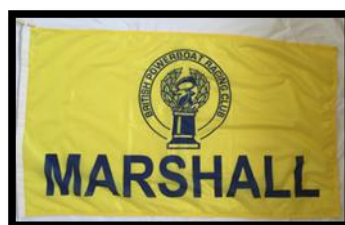
Fig 2: BPRC Marshall Flag

This procedure will then be repeated for the Coves – Poole – Coves race start at 09:45, however competitors will run abreast either side of the start boat. A Classic Boat rally will commence at 10:00. The pre-start corridor off Coves will be marshalled by 10 boats flying a BPRC Marshal flag (see Fig 2) and the Coves Harbour Master Launch will be stationed in the Outer Fairway monitoring VHF Channel 69.