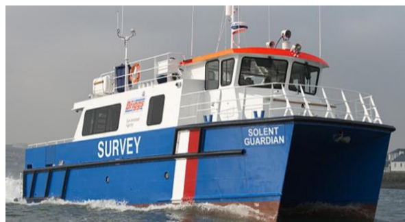
Figure 3 – SOLENT GUARDIAN