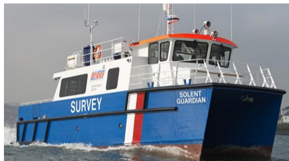
Figure 3 – SOLENT GUARDIAN

3. Both vessels will be considered to be Restricted in Ability to Manoeuvre when conducting underwater survey operations and, as such, mariners are reminded of their responsibilities under the COLREGS and are requested to remain well clear and to give a wide berth while passing. Both vessels will maintain a listening watch on VHF Channels 11 (QHM Harbour Control) and 12 (VTS Southampton) throughout. QHM and VTS can be contacted over VHF or by calling 023 9272 3694 (QHM) or 023 8048 8800 (VTS).