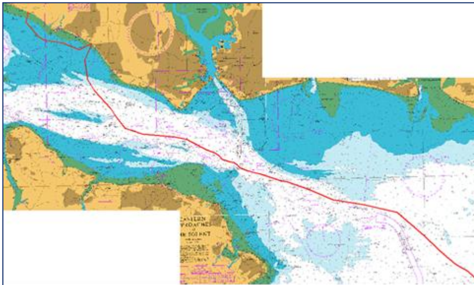
Figure 1 – Survey Route

1. NOTICE IS HEREBY GIVEN , in conjunction with the Queen's Harbour Master Portsmouth, that the Interconnexion France-Angleterre 2 (IFA2) Cable Route survey is continuing in the eastern Solent and is likely to continue until late January 2018. The remaining survey tasks are predominantly to the east of No Man's Land and Horse Sand Forts and involve some underwater operations including the use of towed submersibles and Remotely Operated Vehicles.