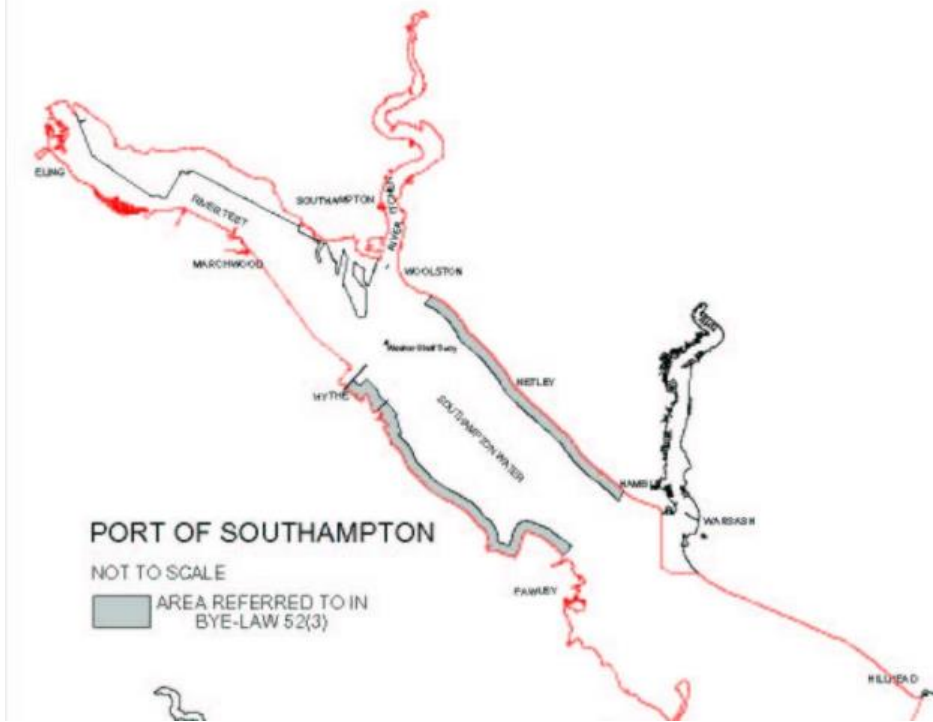
Figure 2 – Area of 6 knot speed limit within 200m of the shore