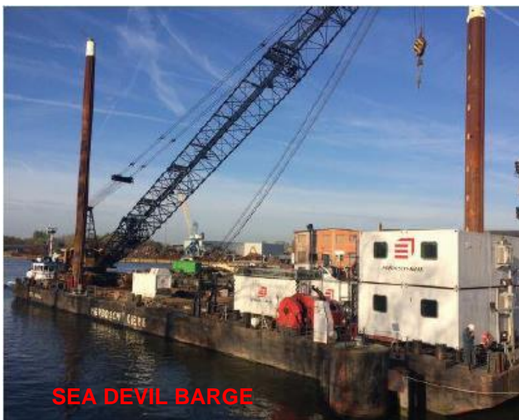
SEA DEVIL BARGE