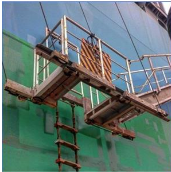
Fig 1: Non-compliant Arrangement

The relevant documents are SOLAS V Regulation 23, IMO Resolution A. 1045 (27) and guidance from Embarkation & Disembarkation of Pilots Code of Safe Practice.